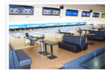
Enagic Bowl Mihama