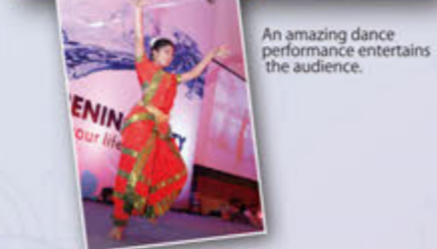
An amazing dance performance entertains the audience.