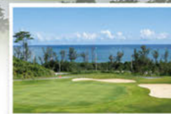
Enagic Sedake Country Club