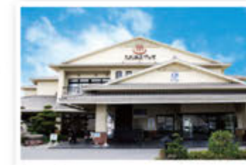
Enagic Natural Hot Spring Aroma