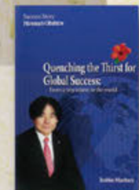
"Quenching Thirst for Global Success"