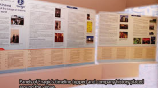
Panels of Enagic's timeline (upper) and company history placed around the venue.

Limited to Registered Enagic Members Only エナジック登録会員限定