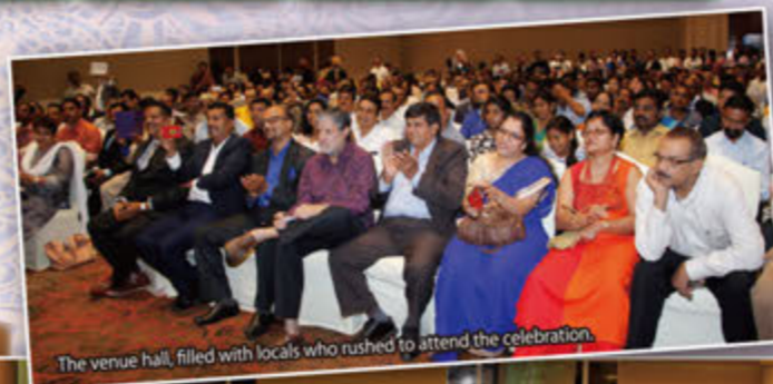
The venue hall, filled with locals who rushed to attend the celebration.