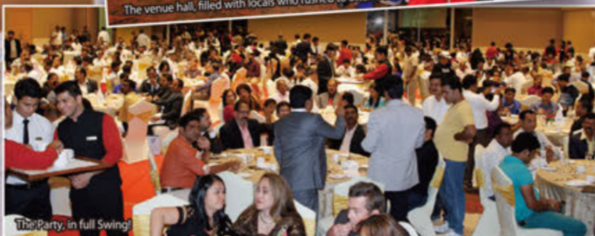
The Party, in full Swing!