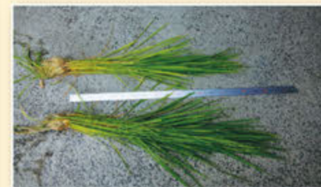
25 stems were collected from Paddy A (above), all short in height, while the 41 stems collected from Paddy B were taller. 上のA田の稲の丈は短く茎は25本、B田の稲は長く茎は41本あった