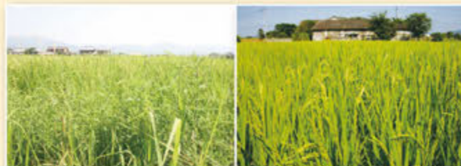
Chemical-free Paddy A (left) is abundant with weeds, while no weeds are found in Paddy B. 無農薬のため雑草(手前の部分)が生い茂るA田(左)と雑草が全く見られないB田

The paddies of Kangen Rice cultivated by Ido Agriculture are located on the outskirts of Takamatsu City, Kagawa. Although this year's increased rainfall and lack of sun caused some unease among the local farmers, the high temperatures and humidity brought on by the end of the rainy season spurred on the growth of the rice plants, assisting in making up the leeway. This climate change not only boosted the growth of the rice plants but also the weeds in the paddies.