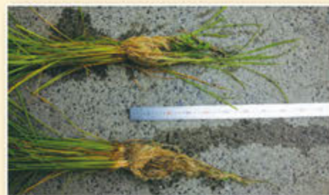
Weeds are entangled in the roots from Paddy A (above), while roots from Paddy B are free of weeds. A田の稲の根(上)には雑草が絡んでいるが、下のB田の稲の根にはない

一方、稲の丈はB田のほうが多少高い。A田では一定期間、水を入れず田を涸らして丈の成長を抑制したためだ。これで風害などを軽減するという。いまの様子ではA田の第一回目の刈り入れは8月中旬。安心安全の還元米が食卓に上るまでもうすぐだ。