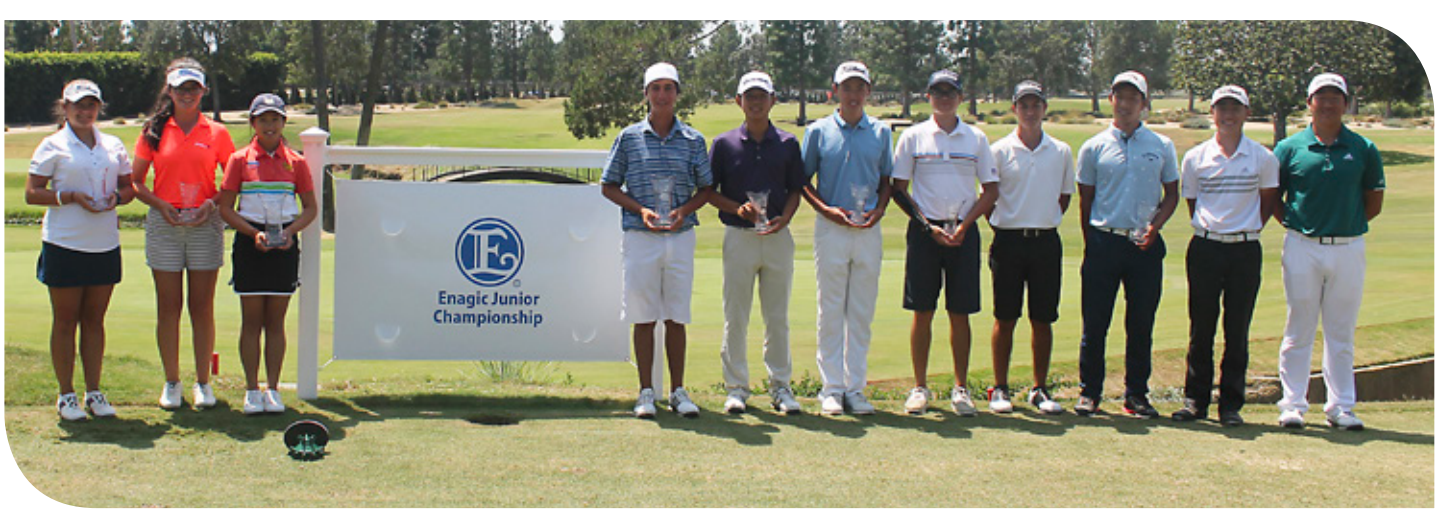
Boys and Girls Winners