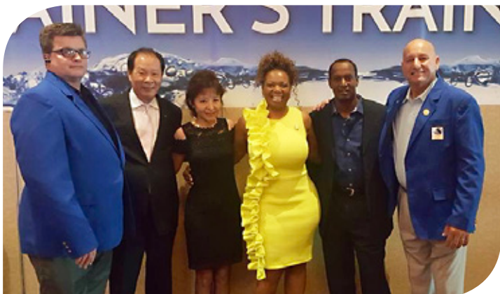
The participants are different nationalities around the world.