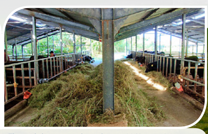
The cattle barn currently stocks over 20 Kangen-Gyus.