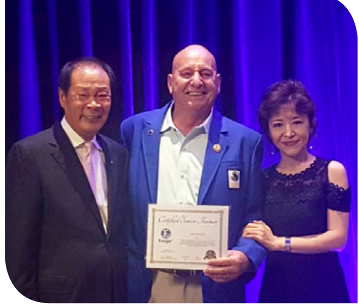
A graduate proudly receives a certificate and gold badge.