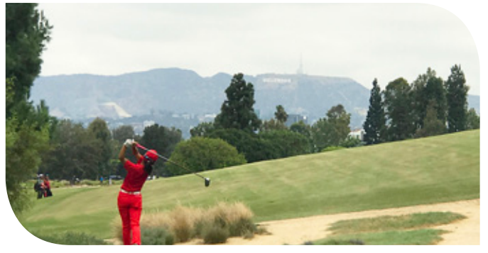
With a view of the Hollywood Sign, a landmark of Los Angeles.