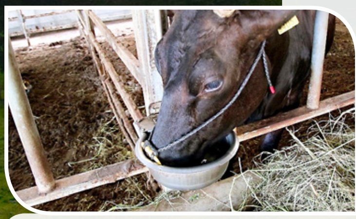
Kangen Water is automatically refilled from the tank into their water bowls.

Our cattle breeding started with only five Kangen-Gyus, which now has increased to over twenty head of cattle. The barn is getting crowded as the cattle grow, and our Kangen Farmers are planning to build an extension. We'll keep you posted with future news and updates, so look forward to more announcements from the Kangen Farm in future issues!