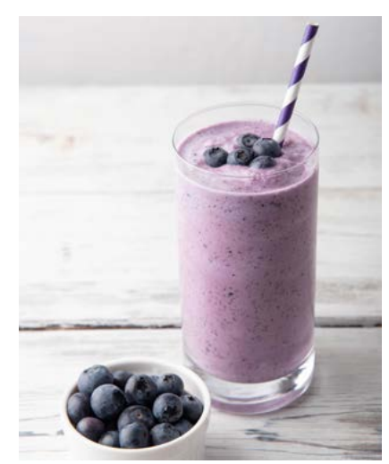
Mind & Body Smoothie