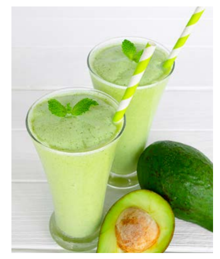
Green Power Smoothie