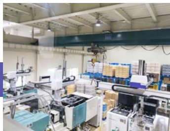
The latest injection molding machines.