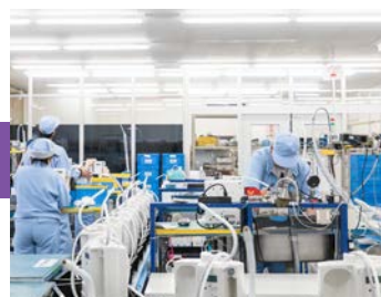
Main assembly line.