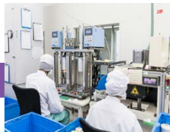
Production Department for cartridges.