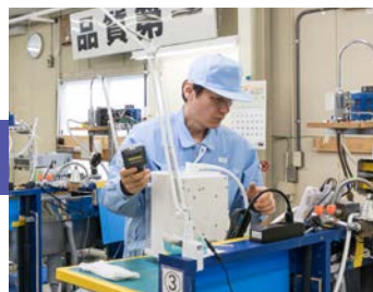
pH testing is also done during water flow testing on the completion line.