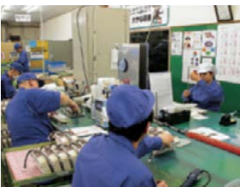
Electrolysis chamber assembly line. Global E-Friends 2022.10