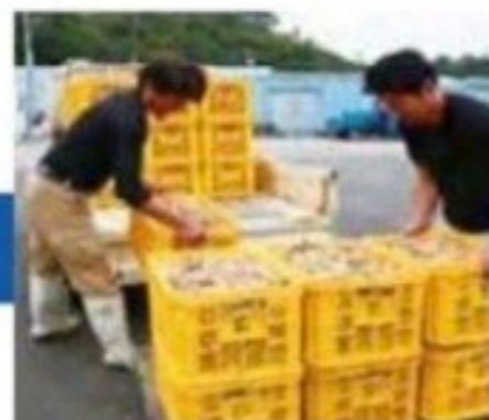
Local farmers harvest Ukon roots in the field and transports them to the factory in crates.