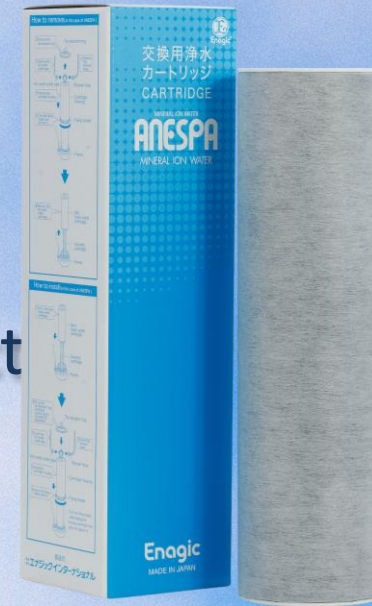
ANESPA EXTERNAL CARTRIDGE