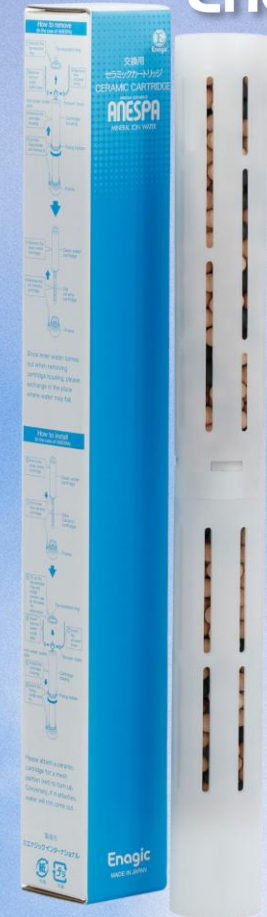
ANESPA INTERNAL CARTRIDGE (CERAMIC)