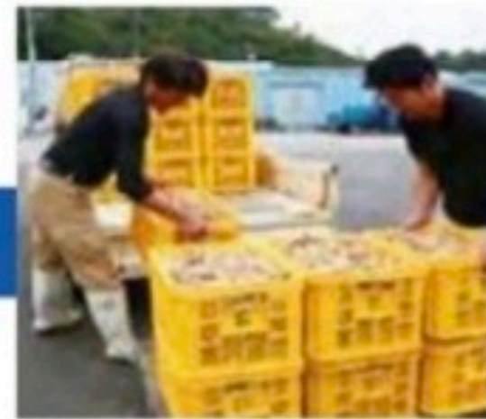
Local farmers harvest Ukon roots in the field and transports them to the factory in crates.