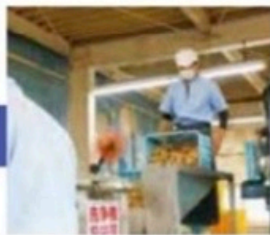
Harvested Ukon (turmeric) is pre-washed in Strong Kangen (pH11.0) Water.